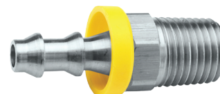
303 stainless steel